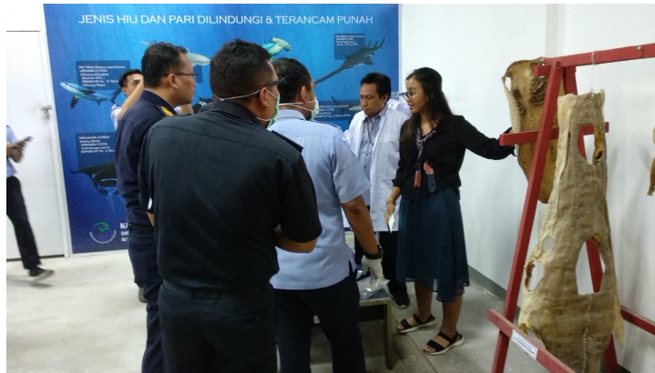
Figure 4. Training of shark and rays identification in Pontianak (Feb 2020).

WCS continues to support law enforcement agencies to investigate the illegal trade in CITES-listed shark and ray species. A new partnership designed to combat illegal wildlife trade in Indonesia that involves MoEF (Ministry of Environment and Forestry), MMAF, Indonesian National Police (INP), Attorney General, Quarantine, Supreme Court, and Customs was formed. During the first three years of the project (2018 – 2021) eight illegal trade cases of marine products has been recorded and successfully prosecuted by law enforcement agencies. Four of these cases used information provided by the WCS (Supp info 11). A total of six cases related to illegal trade of CITES Appendix II listed sharks and protected species such as hammerheads, sawfish, manta rays, and silky sharks.