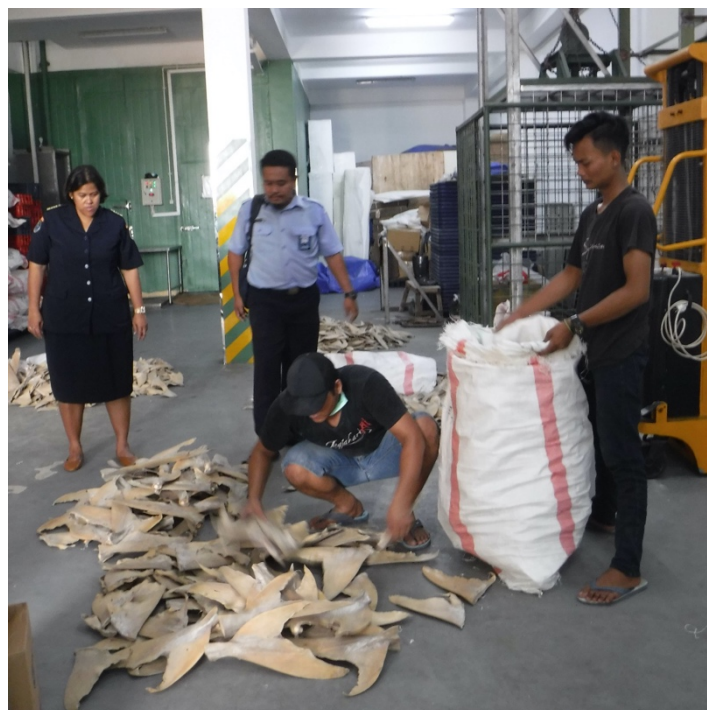
Figure 5. Inspection on the exported good in Surabaya by MMAF found protected shark mixed with other fishes (January 2019).

During the project, WCS have supported MMAF (BPSPL Denpasar) and PSDKP Surabaya on a case in Surabaya (January 2019; Figure 4) concerning the export of products from a company CV. Tirta Surya Sri Rejeki. The team found indications of sawfish mixed amongst the other fish products. Having confirmed with DNA testing that the product derived from one of the protected species, the director of the company was arrested and charged under Law No. 31 (2004; fisheries legislation) for trading 438 kg of sawfish fins, which equates to around 1528 individuals. In July 2019, he was convicted and sentenced to one month in prison and having to pay a penalty of USD (Supp info 11).