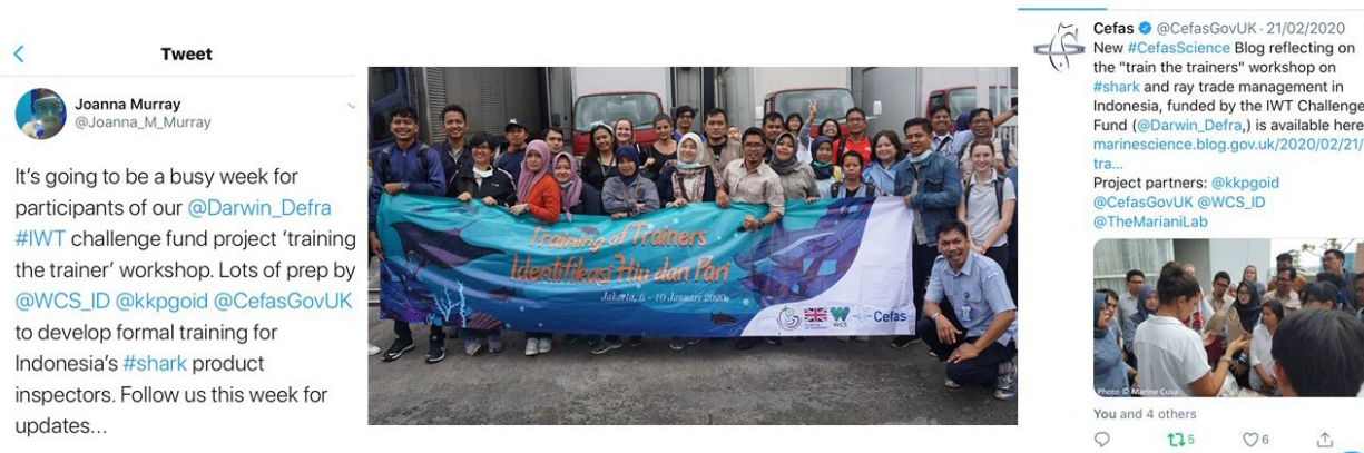
Figure 5. Selected Tweets and the banner from the ‘training of trainers’ workshop demonstrating the @Darwin_Defra tag and UK government funding logo respectively.

We have ensured that the UK Government funding logo has been used in project presentations, meeting invites and on workshop banners (Figure 6). We have also included the @Darwin_Defra tag in select Tweets (Figure 6) and will ensure all Tweet include the IWT Challenge Fund tag when it becomes available.