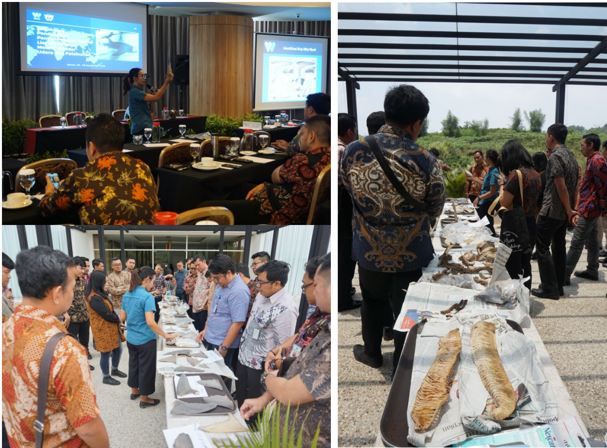
Figure 3. Participants from Customs in September 2019 undertaking training in shark and ray derivative product identification (shark fins, ray fins and manta gill plate).

In February 2020, WCS Indonesia collaborated with BPSPL Pontianak, the Quarantine Agency and Marine surveillance (Area Pontianak), on an identification training course for shark and ray products. A total of eight staff from the Quarantine Agency and Marine Surveillance team attended the one-day training event which was focused on identifying derivate products from protected shark and ray species (whale shark, sawfish and manta ray) and CITES Appendix II listed species (hammerhead, silky shark, mako shark, and wedgefis). Participants received training on trade control procedures, starting from the verification process, the issuing of the recommendation letter by BPSPL staff, and the issuing of the health certificate (HC) by the Quarantine Agency when the letter of recommendation has been received.