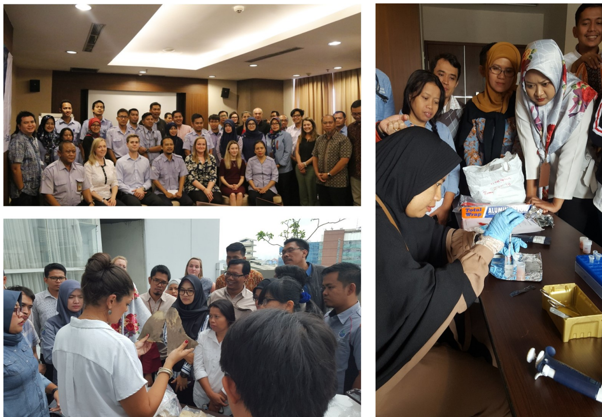
Figure 2. Participants at the ‘train the trainers’ workshop in January 2020 undertaking training in visual species identification and the extraction of DNA for molecular approaches to species identification of products.

had increased their visual ID skills following training (Supp info 8). A twenty percent improvement in knowledge was achieved following training (66% correct answers in pre-test, 86% correct answers in post-test). Data collected on the accuracy of visual and molecular identification was collected by the PhD student and will inform the production of a peer-reviewed publication (activity 2.9) towards the end of the second year of the PhD (pending analysis of DNA samples when university laboratories re-open following Covid19).